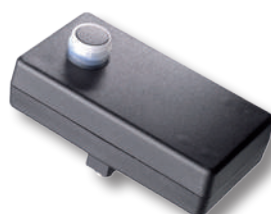
FLUX FRC 100