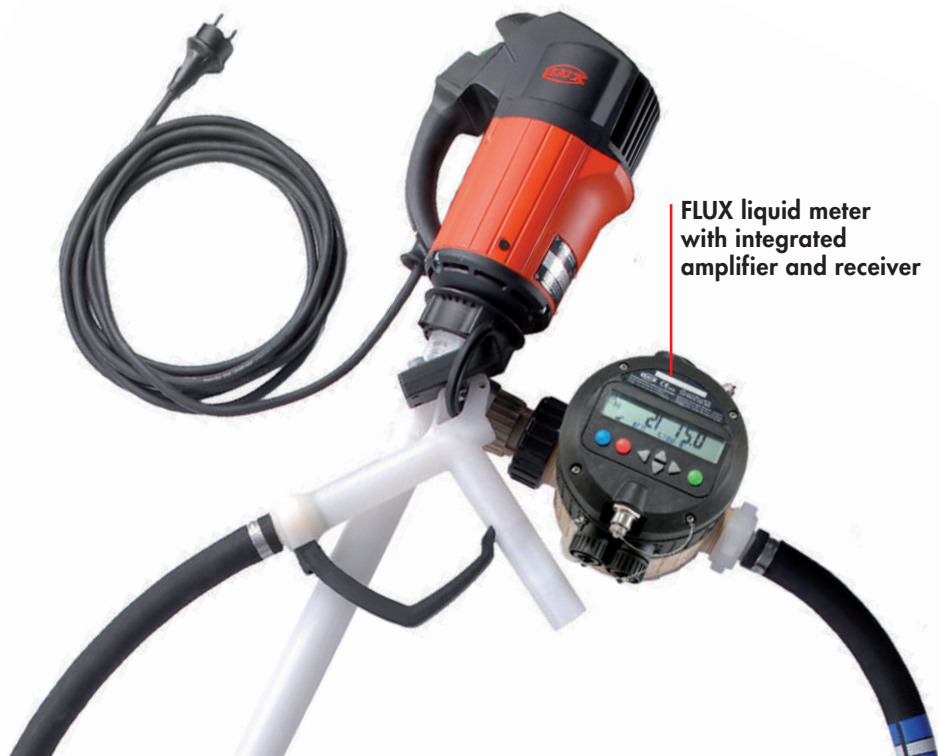
FLUX liquid meter with integrated amplifier and receiver

High viscosity liquids motors with air-operated pumps