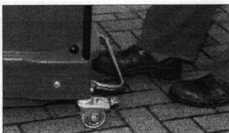
Foot lever actuated dust pan